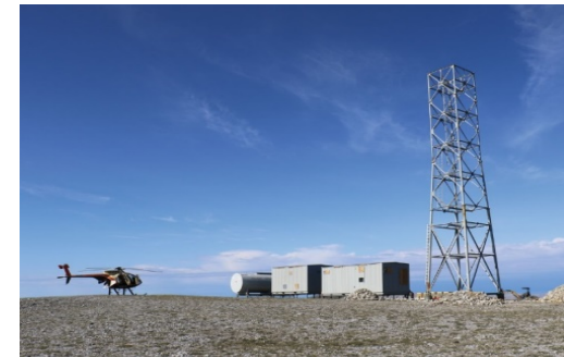
Waldec Cell Tower Foundation Design Provided the design and construction engineering services for the Waldec 170-foot Lattice Tower. 2006 to 2006.