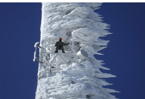
Clearwire Cell Tower Foundation Design Provided the design and Construction Engineering Services for three separate wooden antenna poles and foundations. 2005 to 2006.

With more than 37 years of engineering and design experience in Alaska and the Pacific Northwest, Great Northern Engineering, LLC (GNE) is familiar with, and appreciates the need for, quality engineering and construction in an arctic environment. Project budgets range from $15,000 to over $50 million.