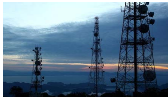
Dobson Tower Foundations, NEPA, & SHPO Provided designs and construction engineering services for over 130 cell towers located throughout the State of Alaska. 2001 to 2009.