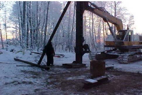
Cooper Landing Pile Cap Redesign Provided the design and construction engineering services for the foundation redesign of the Cooper Landing Gun Club Tower. 1996 to 1997.