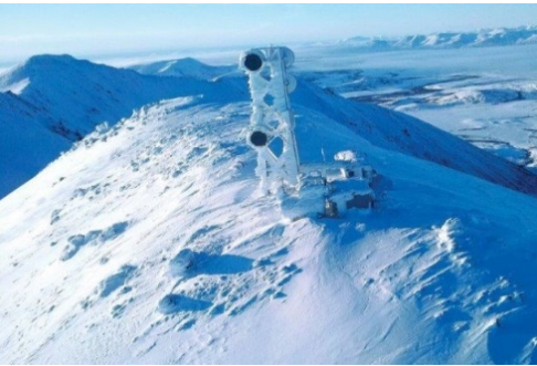
Old Harbor Cell Tower NEPA Reports Provided the National Environmental Policy Act (NEPA) Reports for twenty cell towers across southern Alaska. 2018 to 2019.