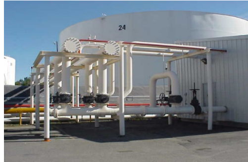
Chevron Bulk Fuel Storage Facility Provided the design for the Chevron Port of Alaska 680,000 tank farm including rail loading. 1997-2011.