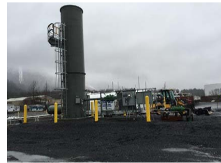
Vapor Combustion Units Provided the designs for several fueling facility Vapor Combustion Units (VCU) across Alaska and the Pacific Northwest. 2012 to present.