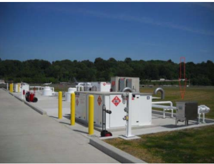
Mente Aviation Fueling System Provided the design for a new state of the art aviation fueling system at the King County Airport. 2015-2017.