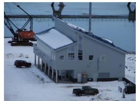
Port MacKenzie Tank Farm Provided the design for the Port MacKenzie Tank Farm and other site facilities. 2010 to present.