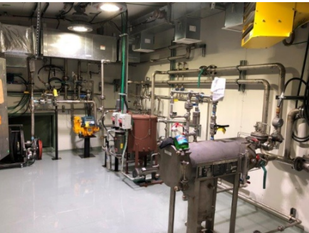
CPAI Alpine Jet Fuel Facility Provided the design for a large expansion to the Alpine Unit Jet-A tank farm and fueling system. 2016-2018.