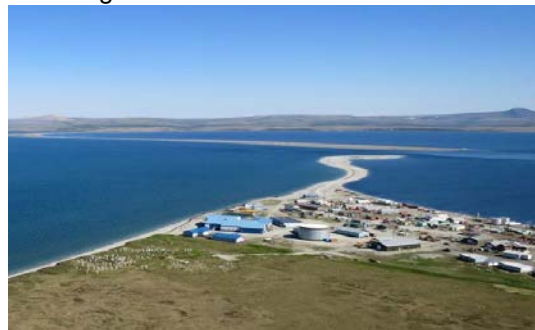
Remote Fueling Systems and Tank Farms Provided designs for multiple tank farms and fueling systems across rural Alaska including the new Teller Village bulk fuel facility. 1995 to present.