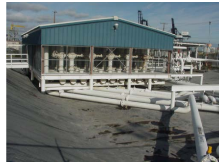
Port of Alaska Valve Yard Provided the POAVY expansion design and designs for all subsequent modifications. 1994 to present.