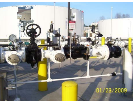
Ted Stevens International Airport Provided the designs for more than 25 projects at Sea-Tac International including the primary tank farm and fueling system. 1994 to present.