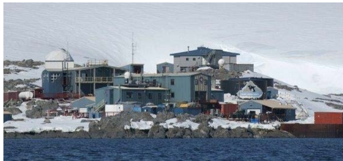
Palmer Station Pier Replacement Provided the design for a new pier and shore facility at Palmer Station on Anvers Island, Antarctica. 2015-2017.